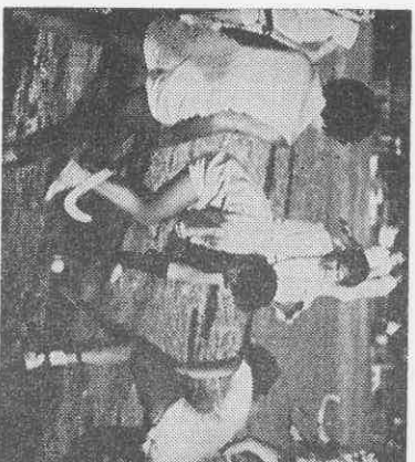
Girls' Sports Day will be held at Southwest, October 21. This is the day that seventeen Southwest hockey players will play host to girls from all high schools in Kansas City.