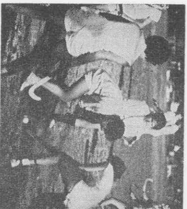
Girls' Sports Day will be held at Southwest, October 21. This is the day that seventeen Southwest hockey players will play host to girls from all high schools in Kansas City.