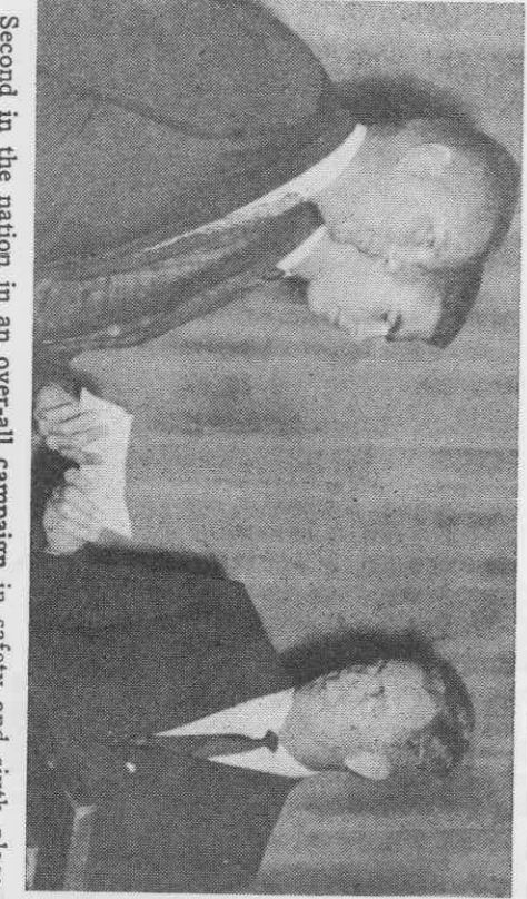
Second in the nation in an over-all campaign in safety and sixth place in the publications division in the sixth annual safety contest sponsored by the American Motorists Insurance Company, brought checks for $200 to the Southwest Trail. This is the sixth year that the school newspaper has placed in this contest.

All in all, it was a good summer for the Activities Council, which forecasts that it will be an even better winter for the Student Council.